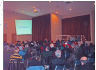
RAIL MEETING JANUARY 23